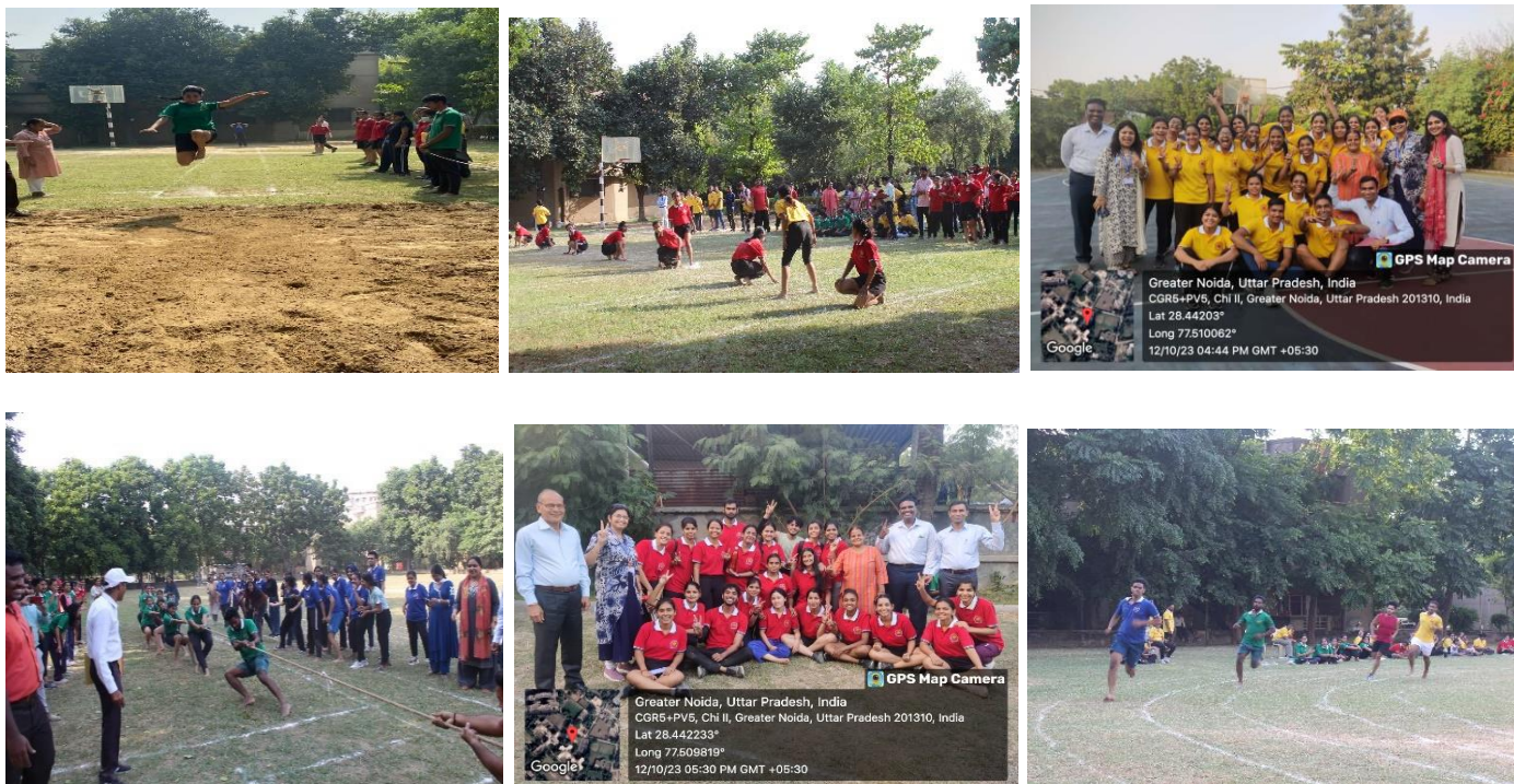
Students exhibiting their strength in various events

A Plethora of events took place throughout the day, beginning with the Kho Kho (Finals), 100 m Race (Men & Women), 200 m Race (Men & Women), 400 m Race (Men & Women), Shot Put (Men & Women), Discus Throw (Men & Women) and Tug of War. The student-teachers demonstrated excellent sportsmanship by competing in each and every event with the utmost enthusiasm and vigour, ultimately achieving victory in every competition they participated.