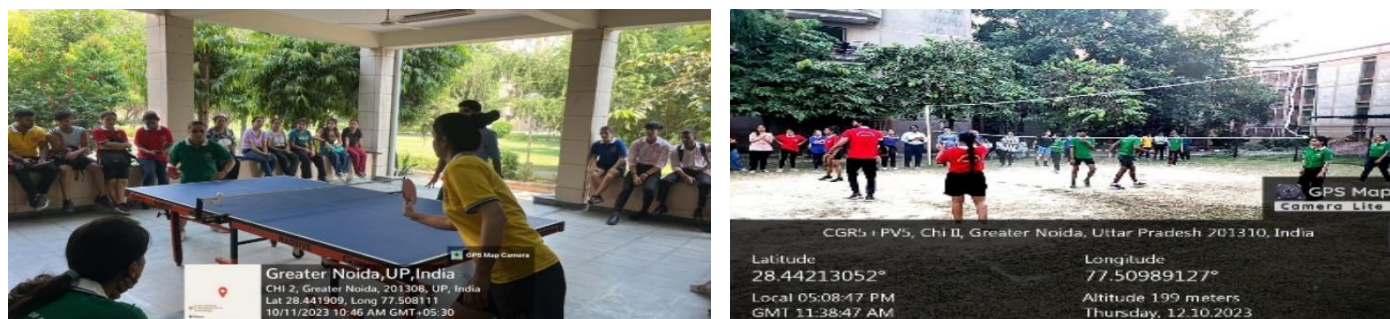
In action during Table Tennis & Volleyball Matches

The day started with the singles and mixed doubles knockout competitions in Volleyball, Kabaddi, Table Tennis, and followed by finals in Badminton, Chess, Carrom. Each of the four houses, Pragma, Pratishtha, Pragyanam, and Pratigya, competed with high level of zeal and showed both team spirit and sportsmanship.