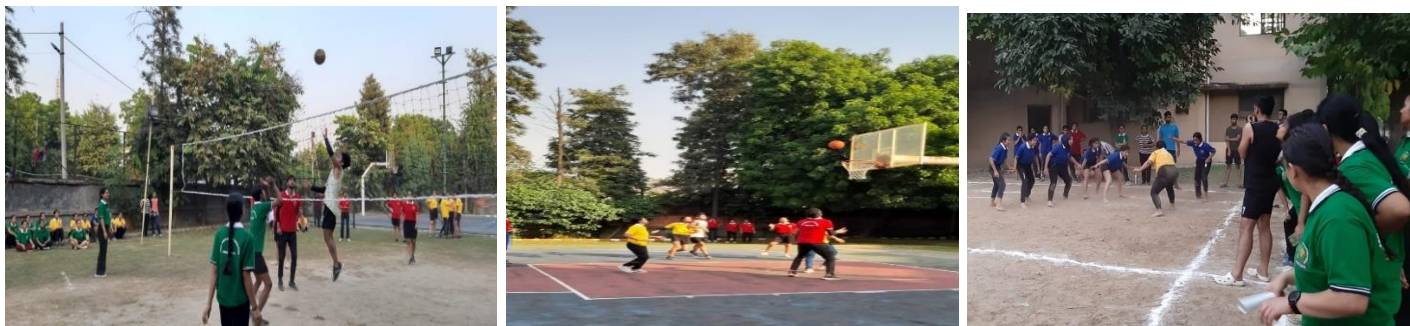
Energetic participants in various events

The evening began with finals in Volleyball, Basketball, Kabaddi and Table Tennis.