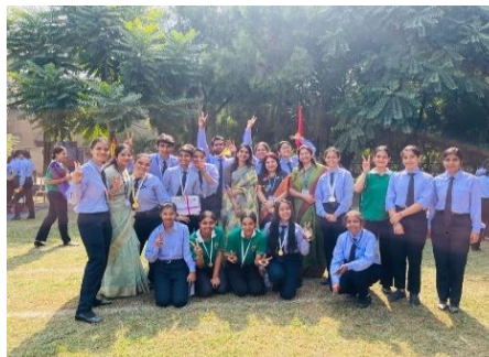
Cheerful smiles after the event