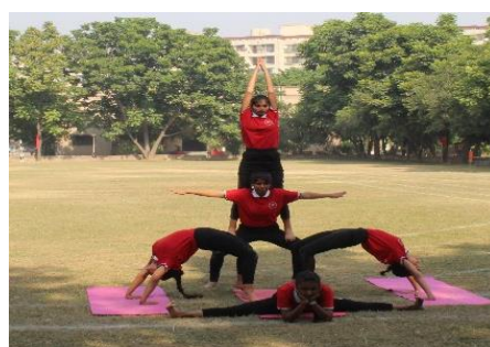
Synchronization & coordination being displayed during March Past & Yoga Competition